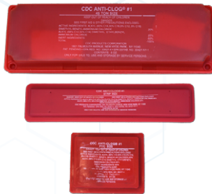
52105 / 52115