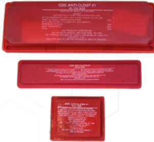
52105 / 52115